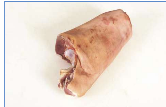
3 Shank – forequarter.