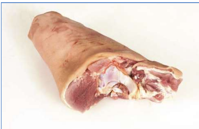
4 Shank – forequarter.