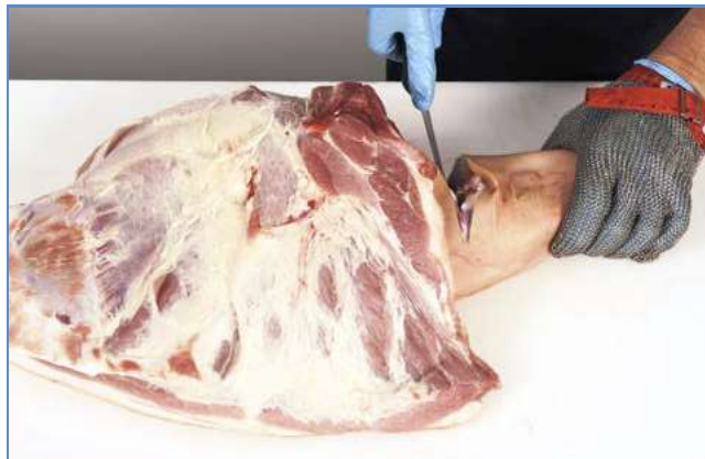
2 The shank is removed from the shoulder through the joint.