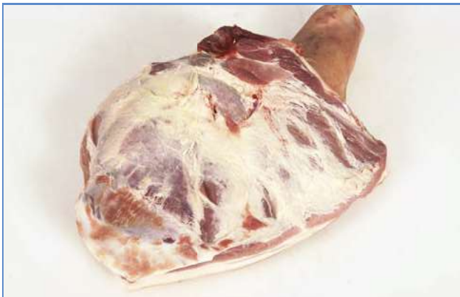
1 Round shoulder of pork.